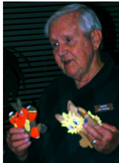
Show & Tell