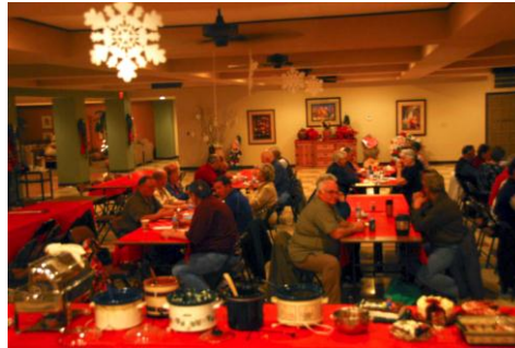
Dinner & Music